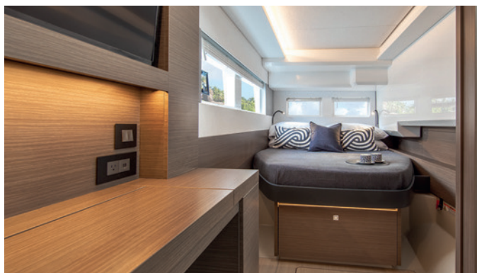
Thanks to the width of the hulls, the cabins benefit from plenty of room, especially the owner's suite, to starboard.