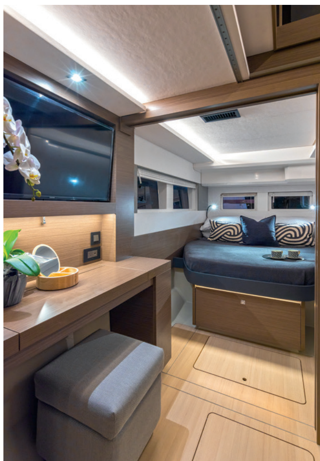
A small desk allows the owner to work on board or can also be used as a dressing table.