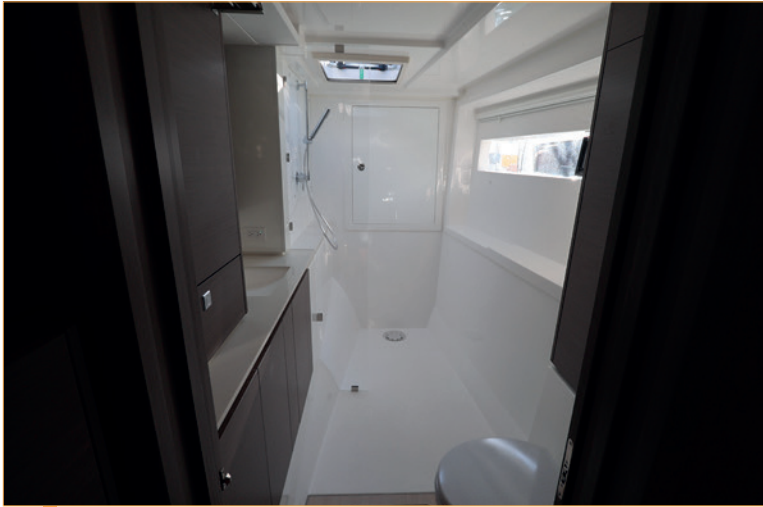
The owner's cabin bathroom is quite large and features an XXL-sized shower.